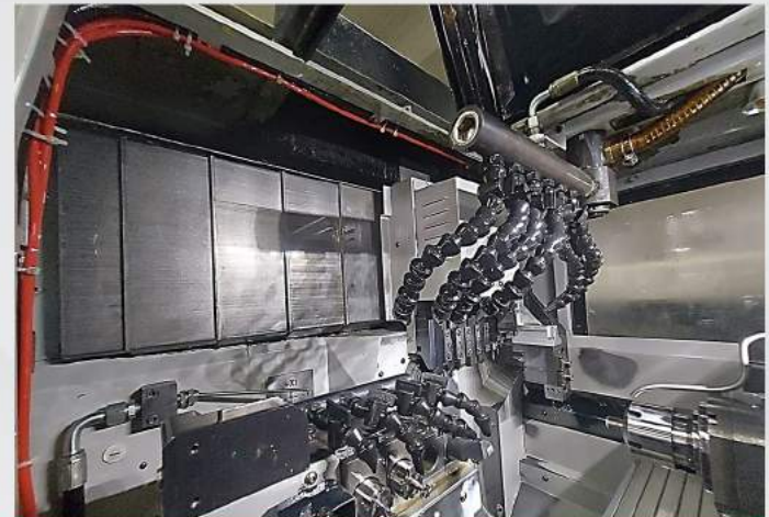
CNC Fire Suppression System